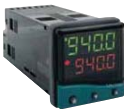
Model 9400 48 x 48 mm (1/16 TH DIN)

Integrated auto-tune makes P.I.D. control simple and efficient, while the unique dAC function minimises overshoot problems associated with conventional P.I.D. Controllers.