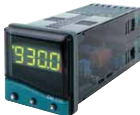
Model 9300 48 x 48 mm (1/16 TH DIN)