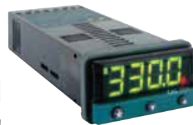
Model 3300 48 x 24 mm (1/32 ND DIN)